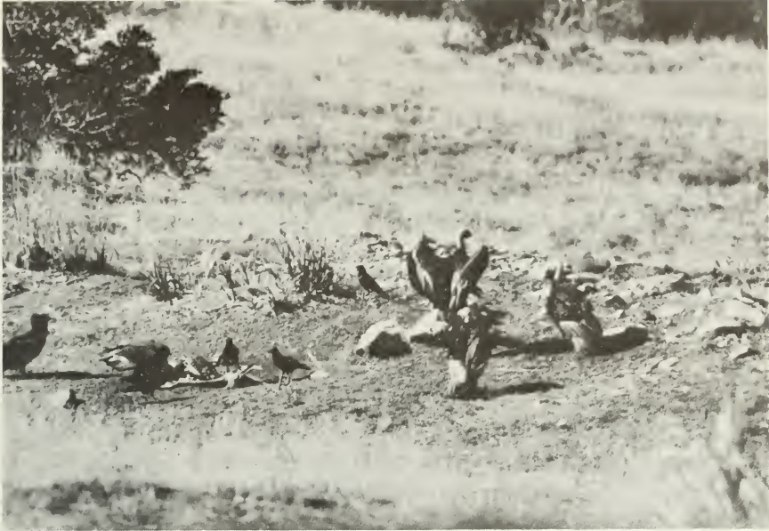
Fig. 5. California condors and ravens gathered at mule deer carcass.

numbers of condors in the past century. He thought direct persecution by man was the most important. A study made in the early 1960's (Miller et al. 1965), however, concluded that food supply for condors was adequate at all times of year, and had not been a limiting factor "since the 1920's." These later findings were based on what researchers considered adequate reproduction and an estimated overabundance of food within the condor foraging range. These authors apparently assumed condors were free to forage into all parts of their total range at all times of year, an assumption that is invalid. Miller et al. (1965) also failed to adequately differentiate between the total amount of food within the condors' range (i.e., all animals that die) and the amount of food actually available to condors (Brown and Watson 1964; Immelmann 1971).